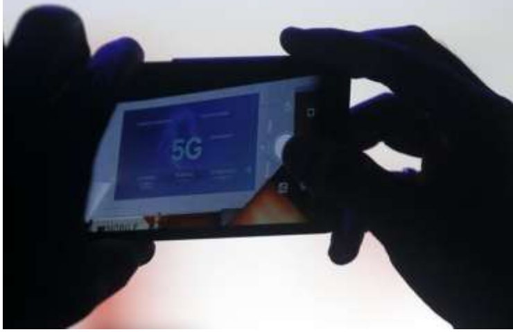
The terms of reference of the high-level Forum for 5G India 2020 shall be — Vision Mission and Goals for the 5G India 2020, and Evaluate, approve road maps & action plans for 5G India 2020.

The department of telecommunications on Tuesday announced the formation of a high-level forum to develop the road map for operationalising fifth generation (5G) services in India by 2020.